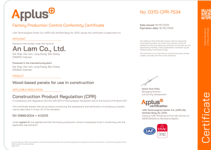
CE — EU Conformity