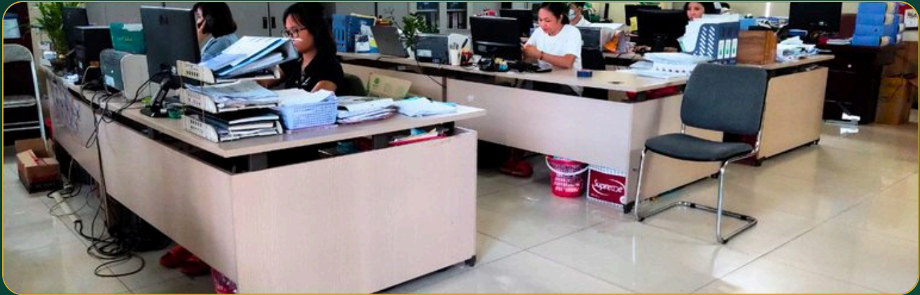
Our export team — Thanh Hoa office