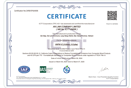
CARB Phase 2 / EPA TSCA